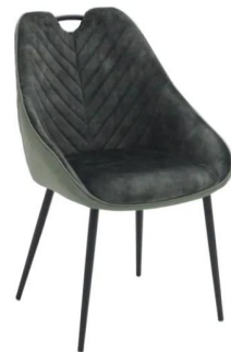
LF - 4