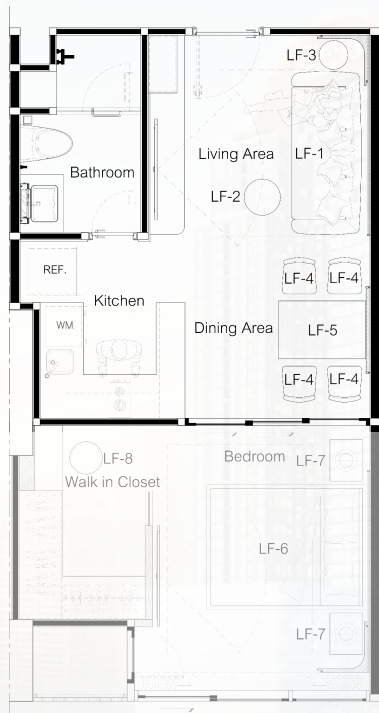
FURNITURE LAYOUT PLAN