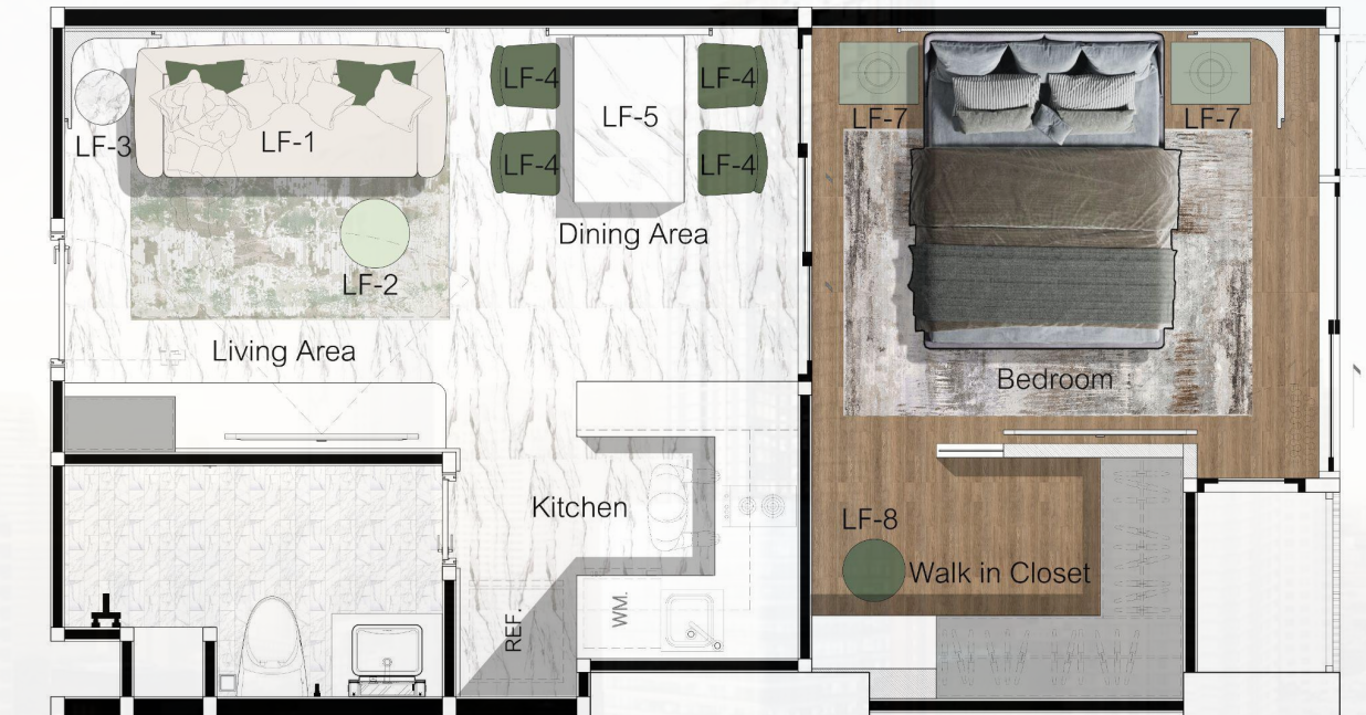
FURNITURE LAYOUT PLAN