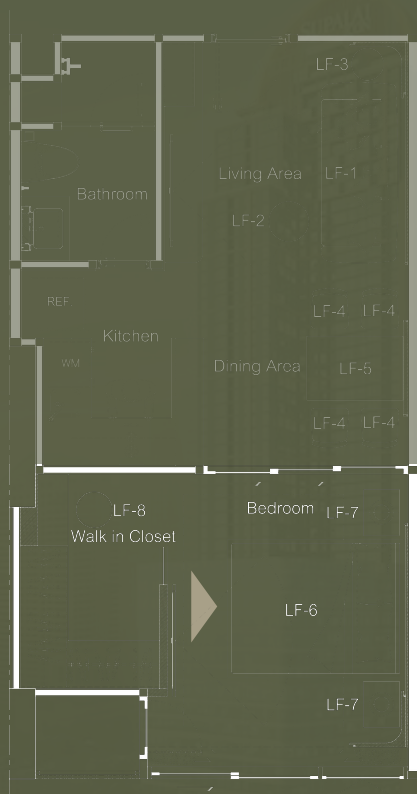
FURNITURE LAYOUT PLAN