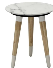
LF - 3