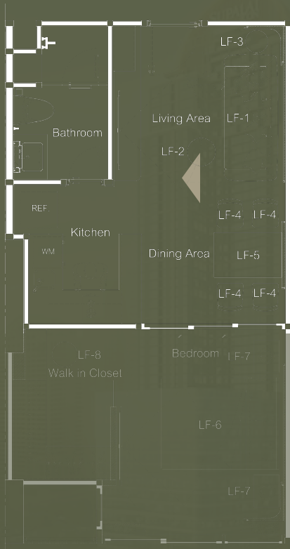
FURNITURE LAYOUT PLAN