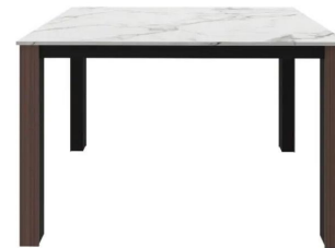
LF - 5