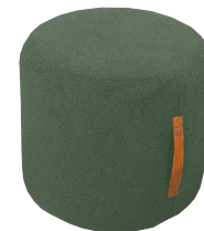
LF - 8