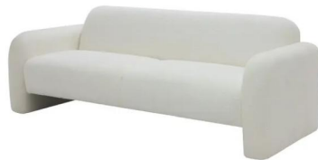
LF - 1