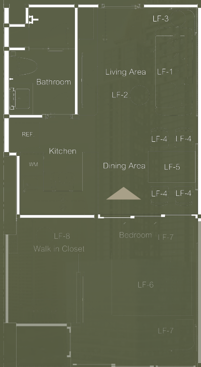
FURNITURE LAYOUT PLAN