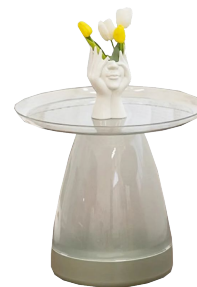
LF - 2