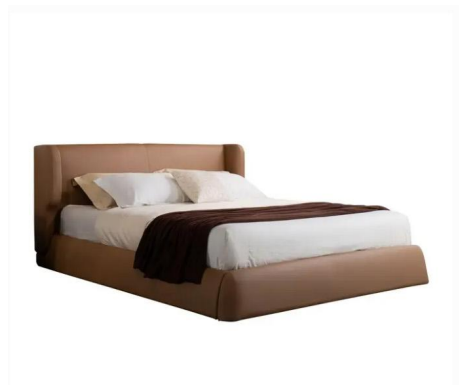
LF - 6