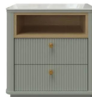
LF - 7