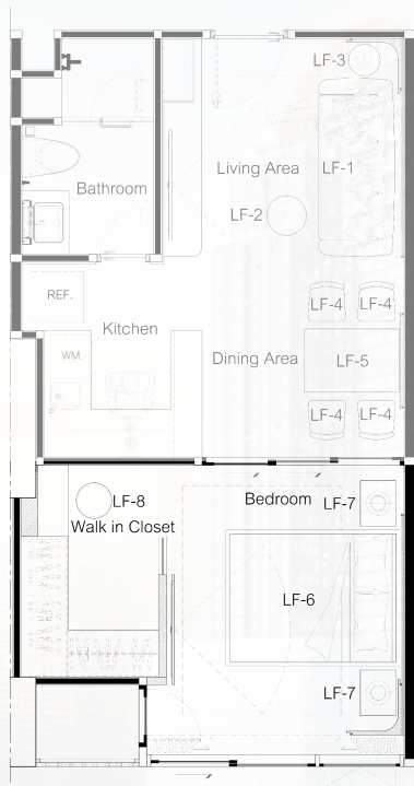
FURNITURE LAYOUT PLAN