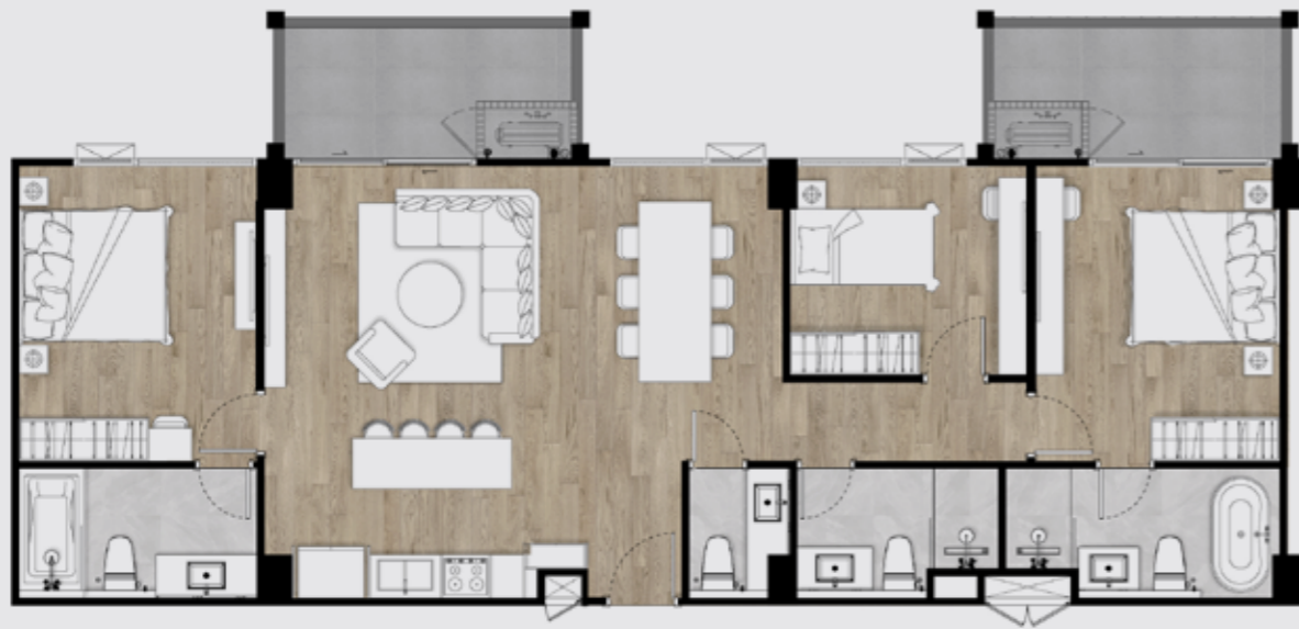
TYPE PENTHOUSE JR | 118 SQM. 3 Bedroom 4 Bathroom