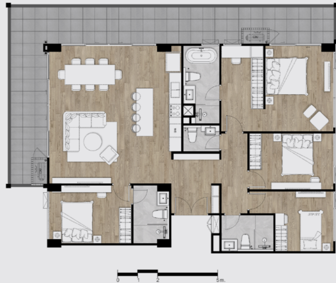
TYPE PENTHOUSE 1 | 180 SQM. 4 Bedroom 4 Bathroom